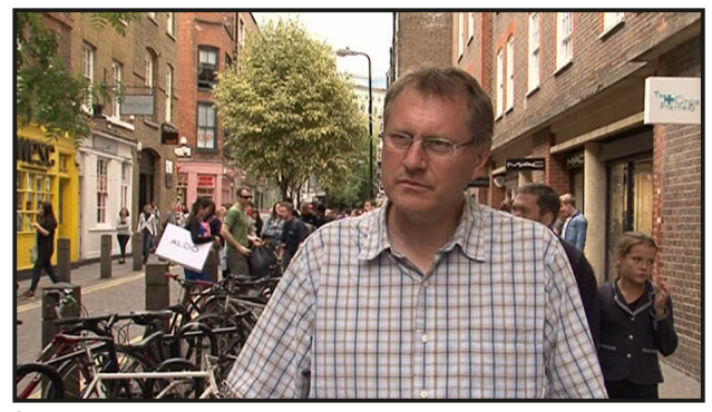
3 Yes, I bought a suit once and I never wore it.