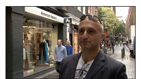
5 Yeah, I did / do.