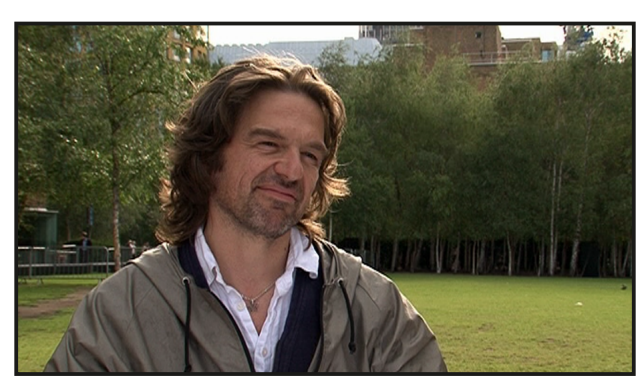
2 Yes, I do. I bought my wife a bracelet but she didn't like it.