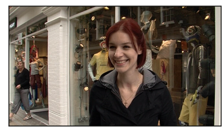
I Yes, I love / like shopping.

5 The people below talk about shopping. Watch the video podcast again from 0:24 to 0:57 and underline their answers to complete the sentences.