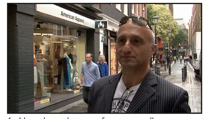
6 I buy shoes that are often too small.

Glossary: wore = past tense of wear; fit = to be the correct size