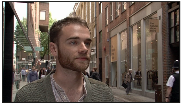
5 I once bought a jacket and it was £119 and it didn't fit me.