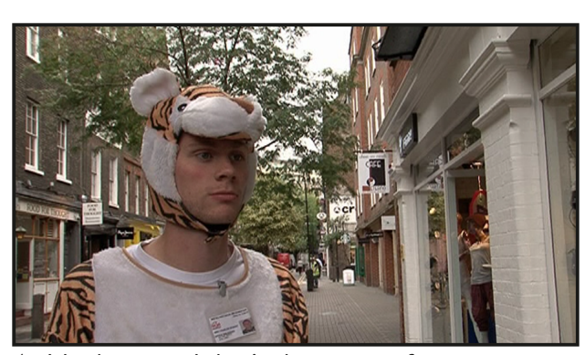
4 No, because I don't shop very often.