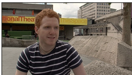
4 Yes, it was, it was good / great fun.