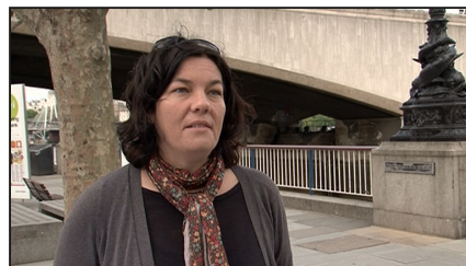
3 It was really / very nice.