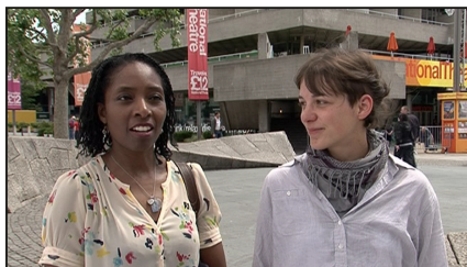
2 I had a wonderful / brilliant time, yes.