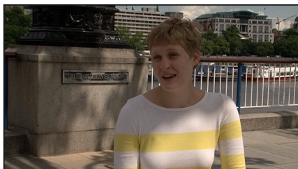
1 I had a lovely / great time.

5 Did the people below all had a good time on their holidays? Watch the video podcast again from 2:47 to 3:24 and underline their answers to complete the sentences.