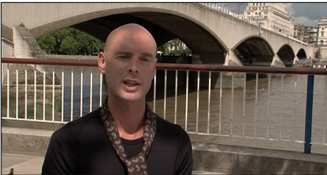
3 My holiday was two _____ long.