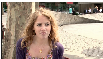
5 I had a very nice / wonderful time.