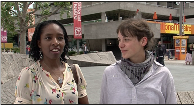
1 About two and a half months , actually. A big one!

3 How long was your holiday? Look at the people below and read their answers. Then watch the video podcast from 1:05 to 1:36 and complete the spaces.