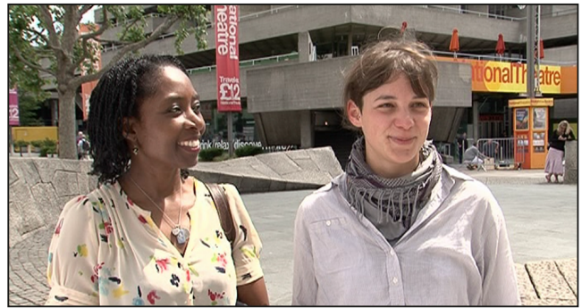
2 Just _____ weeks.