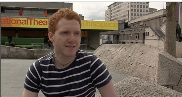
5 I stayed for _____ weeks.