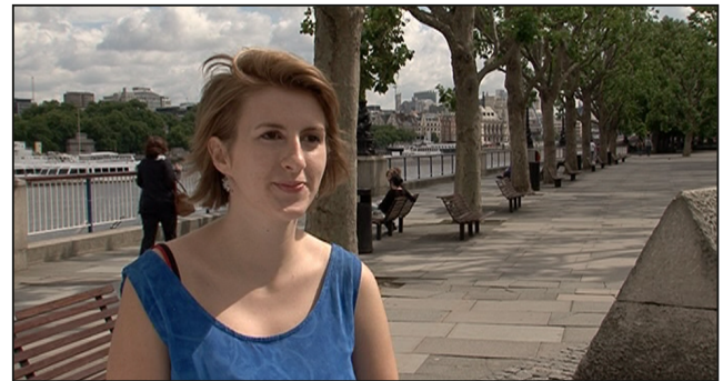
4 I was there for one _____.