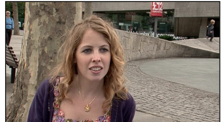
6 14th ____