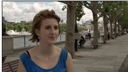
5 29th ____