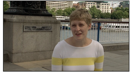
3 December ____