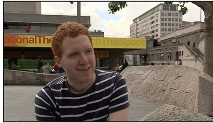
2 August ____