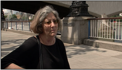
1 March 31st

5 The people below talk about the dates of their birthdays. Watch the video podcast again from 0:27 to 0:53 and complete the dates.