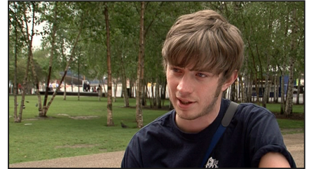
3 I go to _____ lot of concerts, like mainly rock music.