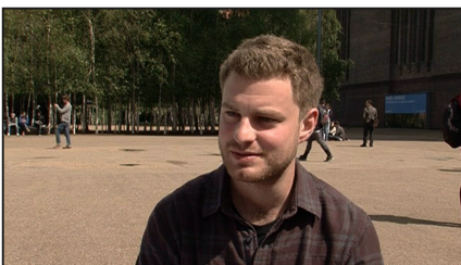
4 I go to a lot _____ concerts.