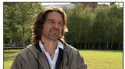
6 I go to concerts and films in London _____ I don't go to plays.

B Watch the video podcast from 2:03 to 2:57 and check your answers.