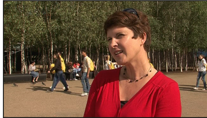
2 I go to the theatre a _____ .