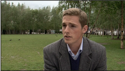
1 I go to plays quite often .