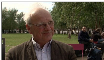
5 We go to _____ a lot of concerts and opera.