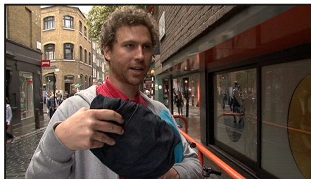
6 A laptop and jeans.