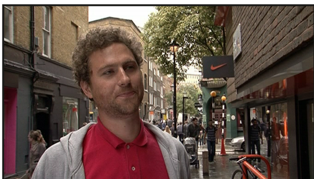
3 My favourite clothes are jeans, T-shirts / a T-shirt and hooded tops.