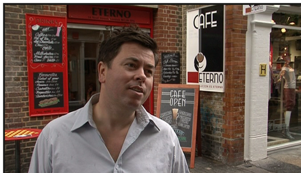
2 I like jeans / a jean and a T-shirt.