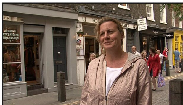
4 I like / My favourite clothes are black and white clothes.