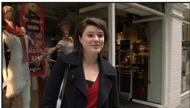
1 My favourite clothes / cloths are my running shoes.

5 The people in the pictures talk about their favourite clothes. Watch the video podcast from 2:06 to 2:57 again and underline their answers to complete the sentences.