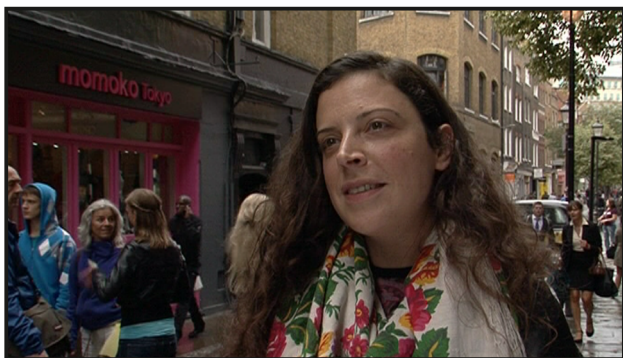
5 I really like / like really colourful designer clothes.