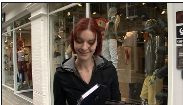
1 My wallet, my diary and my phone. F

3 What's in your bag? Look at the people below and read the answers. Check new words in your dictionary. Then watch the video podcast from 0:27 to 1:46 again and write true (T) or false (F) next to each answer.