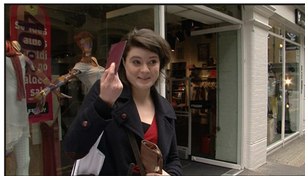
2 My wallet, my passport and my phone.