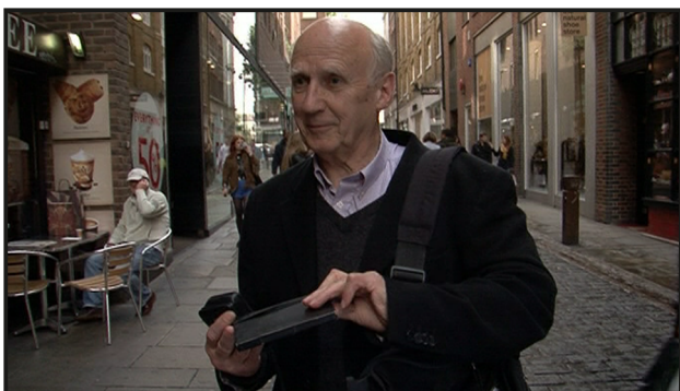
5 A camera, a notebook and a pen.