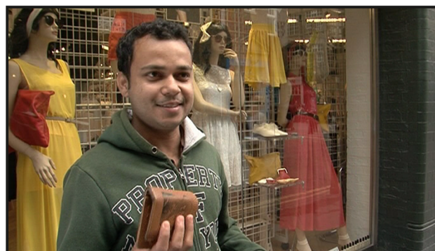
4 My mobile and my keys.