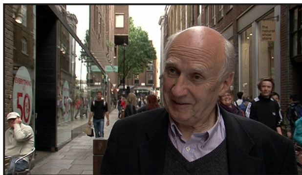
6 Well, I like this / these jacket.

Glossary: colourful = bright colours, e.g. yellow, blue, green; designer clothes = clothes by famous designers, e.g. Versace, Armani