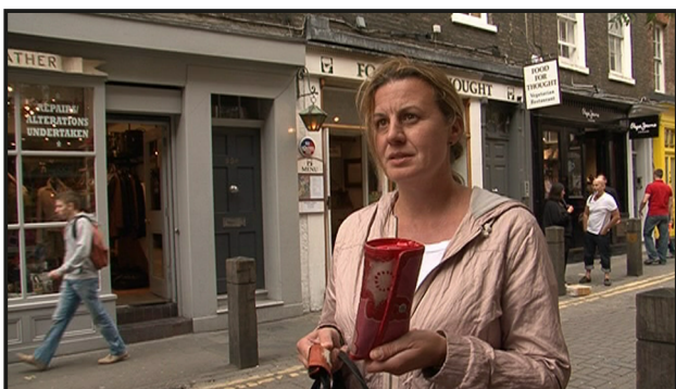
3 My purse and my sunglasses.